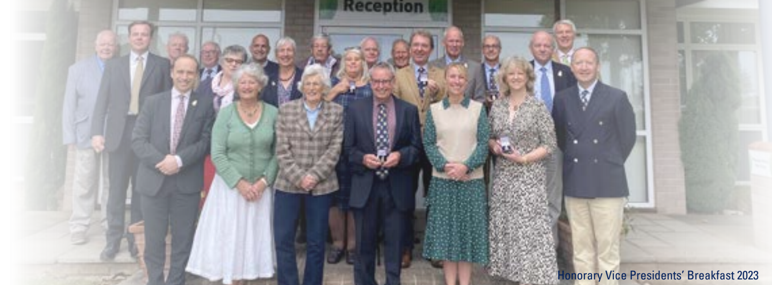
Honorary Vice Presidents' Breakfast 2023