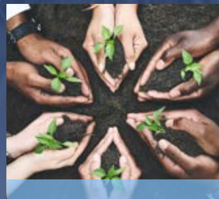
SUPPORT TO AGRICULTURAL CHARITIES

Recognising the importance of local agricultural charities, we continue to further our close relationship with the YANA (You Are Not Alone) charity and provide the charity with office facilities. The Norfolk Federation of Young Farmers Clubs headquarters is co-located with the RNAA office. Norfolk FWAG (Farming and Wildlife Advisory Group) has re-located its office to Norfolk Showground. The development of a hub of like-minded organisations will help enable further collaboration and idea sharing as we support the agricultural sector in Norfolk. Practical support was provided to the Aylsham Show and the Wayland Show. Additionally, the Association provided support to the Norfolk Community Foundation's Nourishing Norfolk project, which aims to alleviate food poverty through the provision of local food hubs. The RNAA has helped coordinate communication efforts with food producers.