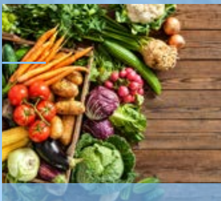
FOOD, FARMING & ENVIRONMENT FORUM

The Association has continued to develop the concept of a food, farming and environment forum to support the local agricultural industry. The concept provides for a broad-based forum that enables access to an intelligence-led network of food and farming organisations for the benefit of collaboration, knowledge exchange and problem solving. Bringing together practitioners, researchers, educators and consumers, the forum aims to enhance the sharing of knowledge, and the ability to solve industry problems at a local level. Activities that contribute to the forum include the Norfolk Farming Conference, RNAA membership activities, and partnership working with, for example, organisations forming part of the Norwich Research Park, to facilitate farmer-researcher relationships.