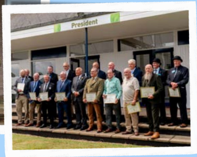
LONG SERVICE AWARDS